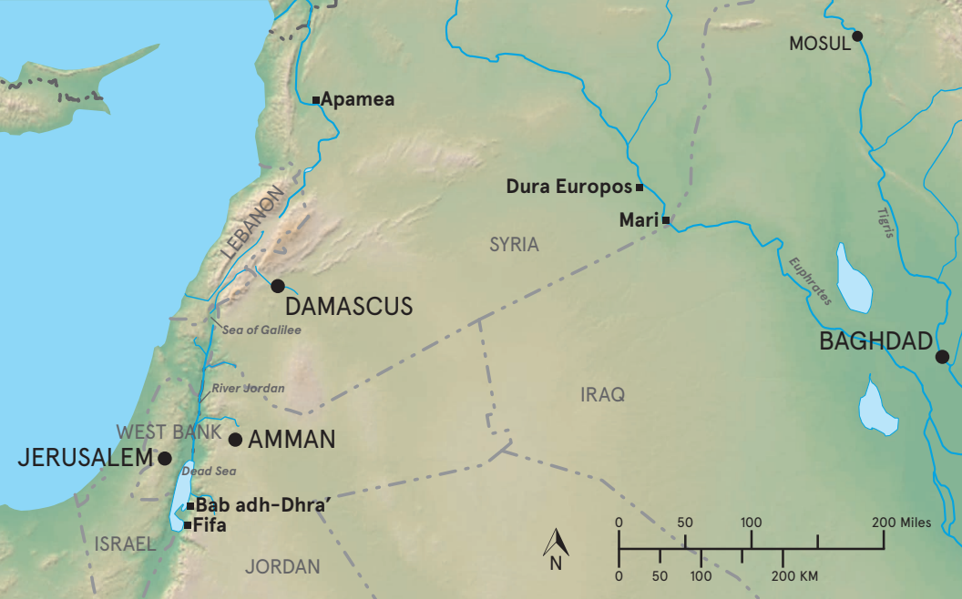
Map: Josh Tullisiak

(3600–2000 BCE) tomb groups from Bab adh-Dhra', Jordan. "Negative" movement is shown by the systematic looting of archaeological sites in the context of the Syrian war, and commonplace, market-driven looting at Fifa, an Early Bronze Age IA (3600–3200 BCE) cemetery along the Dead Sea Plain in Jordan. We can think of these, in shorthand, as the good, the bad, and the ugly. Each of these cases is the subject of a focused project headed by "Past for Sale" researchers. Artifacts and archival documents from the "Follow the Pots" project illustrate how buried objects make their way from graves in Jordan to the collections of the Oriental Institute and the McCormick Theological Seminary. Maps and market records help the "Modeling the Antiquities Trade in Iraq and Syria (MANTIS)" project establish trajectories and monetary values of archaeological artifacts looted from war-torn Syria. Finally, drone flyovers at Fifa led by the "Landscapes of the Dead" project are providing data on an "ugly" landscape that is changing in response to demand for Early Bronze Age vessels. The Past Sold offers creative thinking about the positive and negative movement of antiquities, pushing the dialogue beyond the entrenched positions of "to move or not to move."